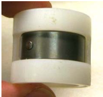
Removable (JA3A4018-1 or 3A4018-1)

Determine which type of sleeve or stop (fixed or removable) is present. See below: